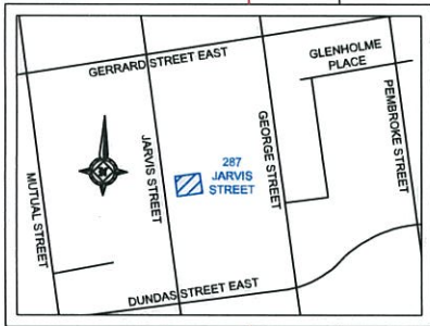
KEY PLAN - N.T.S.