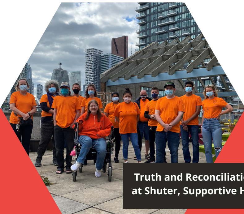
Truth and Reconciliation Day at Shuter, Supportive Housing