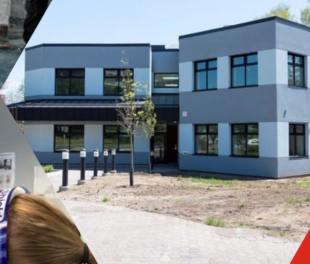
Our Newest Location