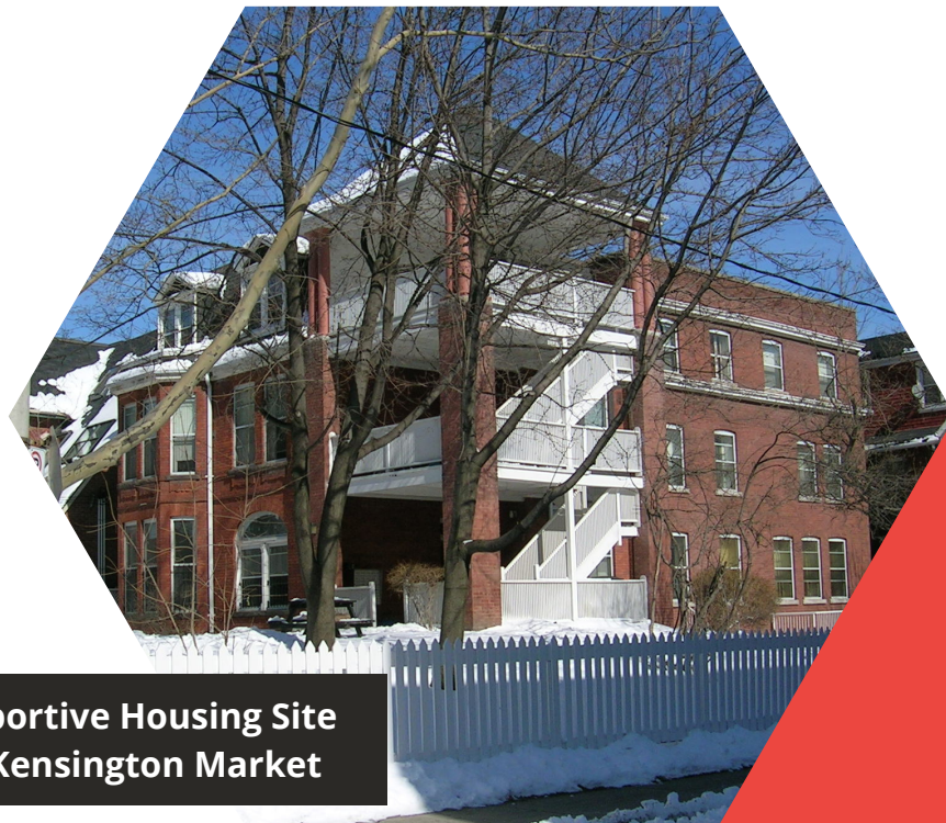
Supportive Housing Site in Kensington Market

The priority population groups for Homes First are the same for both shelters and long-term, stable housing. Although the population served through shelters is determined more by external factors and is often more diverse, Homes First strategically aims to direct its housing services to identified core populations that the organization is best equipped to serve.