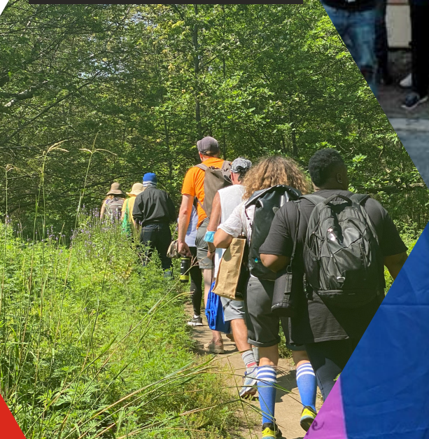
Street to Trail Hike: First Outdoor Program of 2021