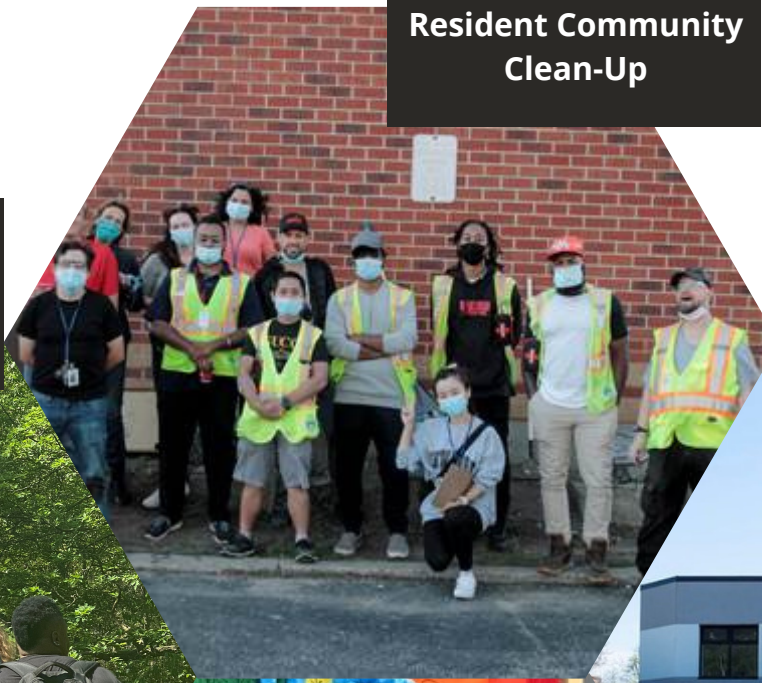
Resident Community Clean-Up